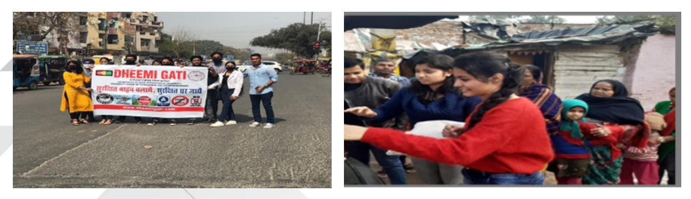
Dheemigati, a road safety initiative by USME, DTU

It organised 'OLD AGE HOME VISIT' at Shashi Raj Foundation located in Shahdara, East Delhi and facilitated the donation of the necessities and hygiene items for the elderly. THIS OZONE DAY, members of NSS, USME, DTU conducted a small plantation drive. A road safety week was organized under which various events such as'Spot the error' quiz competition were held, wherein some pictures were shown and contestants had to identify the traffic rule violations. Meme making competition was also conducted to make memes to spread traffic awareness, and road safety anthem was composed in collaboration with "Shiddat" to spread awareness.