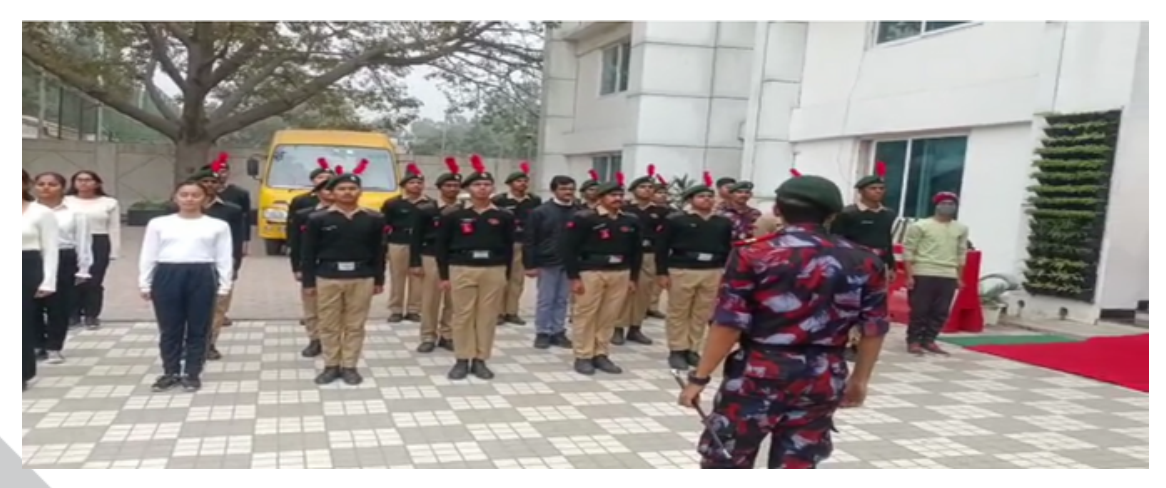
Commencement of new NCC Cadet at USME, DTU East Campus on the eve of Republic Day Celebrations on Jan 25, 2023