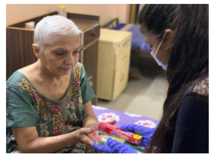
NSS WINTER DONATION DRIVE: 100 plus winter clothes, and books for children donated at Seelampur, East Delhi.

NSS division at USME, DTU works on the motto "Not me, but YOU" and aims to provide hands-on experience to young students in delivering community service. NSS initiatives at USME, DTU include Project PATHSHALA, which is based on providing free education to every student during the Covid-19 pandemic in collaboration with NGO "E-vidyaloka", where our volunteers provided full-fledged videos for live classes of various subjects broadcasted in Uttarakhand state.