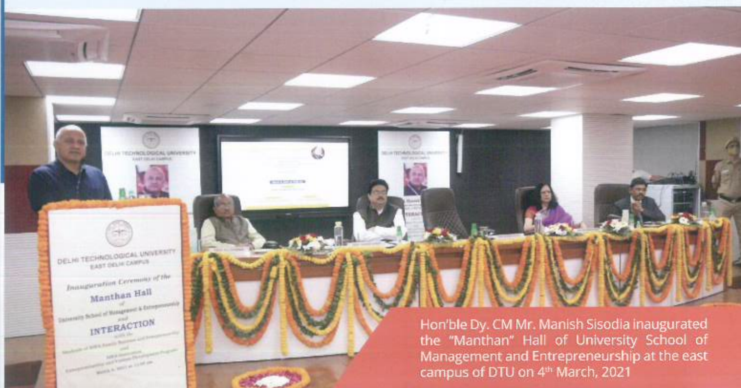
Hon'ble Dy. CM Mr. Manish Sisodia inaugurated the "Manthan" Hall of University School of Management and Entrepreneurship at the east campus of DTU on 4 th March, 2021

Our students have won over twenty awards in inter-college and national level competitions, such as first position in a Mock Stock event organized by Delhi University, first position in an Acquisition Bidding event organized at Ahmedabad University, finalists in case and strategy competitions held at IIM Tiruchirappalli and SRCC, winners of the business case analysis competition at IMT Ghaziabad, ranking positions in the MUN, first five ranks in the national Top Rankers competition, etc in the past.