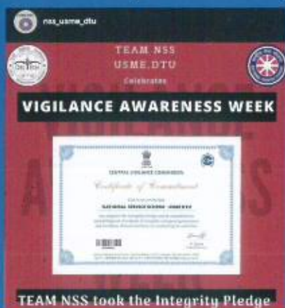
TEAM NSS took the Integrity Pledge

NSS division at USME, DTU Works on the motto "Not me, but YOU" and aims to provide hands-on experience to young students in delivering community service. NSS Initiatives at USME, DTU include Project PATHSHALA is based upon providing free education to every student during covid pandemic in collaboration with NGO "E-vidyaloka" where our volunteers provided full-fledged videos for live classes in various subjects broadcast in Uttarakhand state. OLD AGE HOME VISIT at Shashi raj foundation located in Shahdara, east Delhi and facilitated donation of the basic necessities and hygiene items for elderly. THIS OZONE DAY members of NSS USME, DTU conducted a small plantation drive. A road safety week was organized under which various