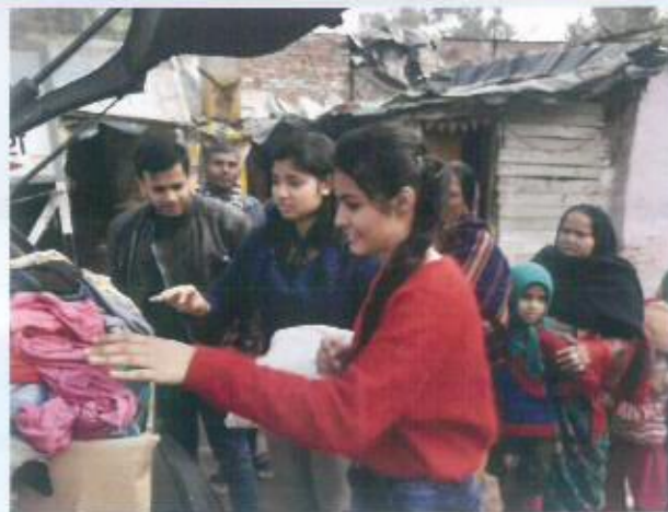
NSS WINTER DONATION DRIVE: 100 plus winter clothes, books for children Seelampur East Delhi.