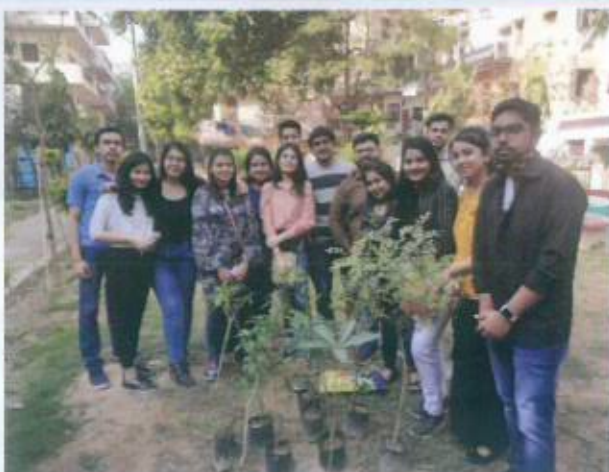
NSS-USME Tree plantation drive, 6 th March 2021 at Satyam enclave, Jhilmil, East Delhi.